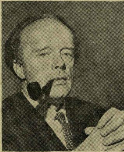
Erskine Childers.